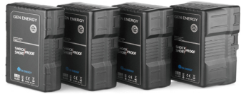
G-B100/98W, 160W, 195W, 290W