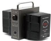
G-PB48 for SKYPANEL