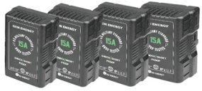
G-B100/160W, 195W, 290W, 390W 15A